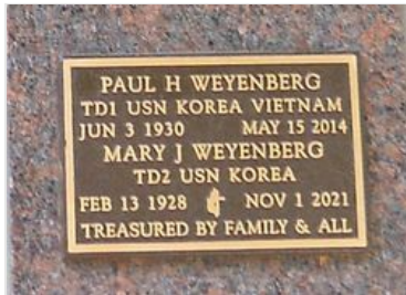
Added by landjnero